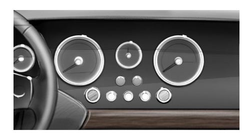
Dashboard - Matte Black Painted