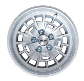
15" Silver Alloy Wheels