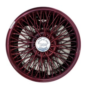
15" Dark Red Painted Wire Wheels