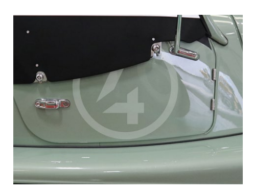
Decal Kit 6 - Door Roundel Matte Clear with Number 0-9