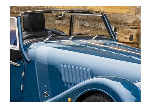
Decal Kit 10 - Bonnet Stripe Matte Clear