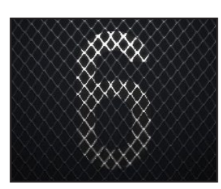
Polished Stone Guard