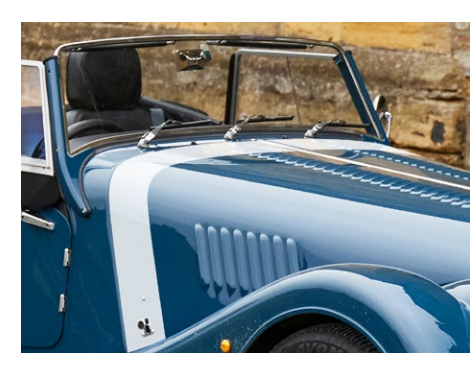
Decal Kit 8 - Bonnet Stripe Gloss Off White