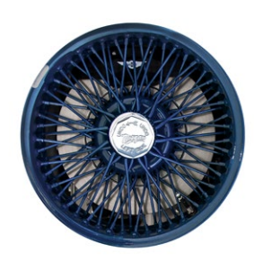
15" Dark Blue Painted Wire Wheels