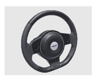
Steering Wheel Centre - Black