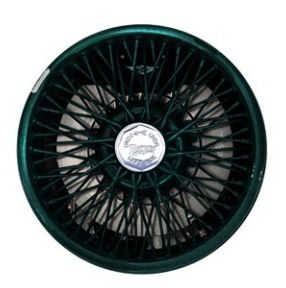
15" Dark Green Painted Wire Wheels