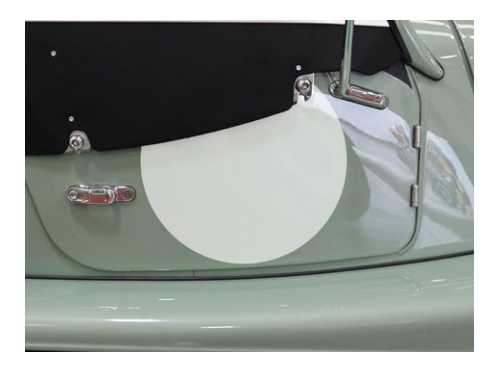
Decal Kit 1 - Door Roundel Gloss, Off White