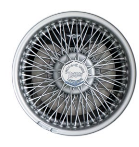
15" Silver Painted Wire Wheels