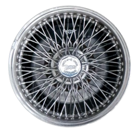
15" Polished Wire Wheels