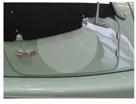
Decal Kit 3 - Door Roundel Matte, Clear