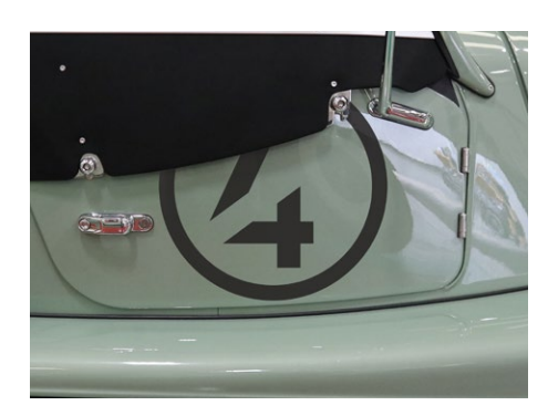
Decal Kit 5 - Door Roundel Matte Black with Number 0-9