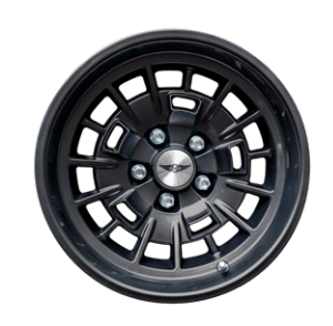
15" Black Alloy Wheels