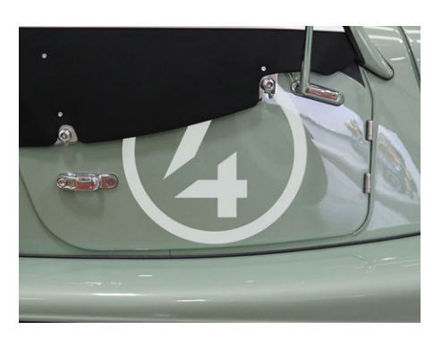
Decal Kit 4 - Door Roundel Gloss Off White with Number 0-9