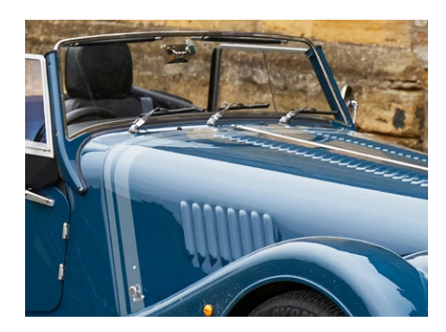
Decal Kit 7 - Matte Stripe Pack