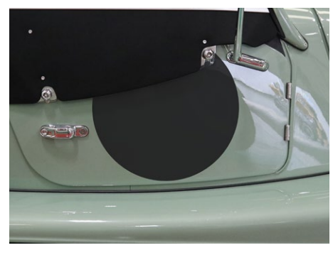
Decal Kit 2 - Door Roundel Gloss, Black