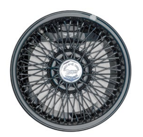
15" Dark Grey Painted Wire Wheels