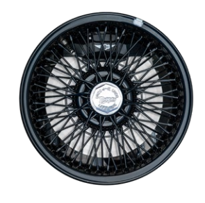
15" Black Painted Wire Wheels