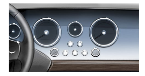
Dashboard - Gloss Body Colour Painted