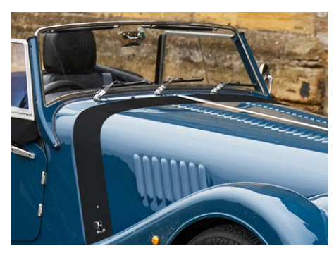
Decal Kit 9 - Bonnet Stripe Matte Black