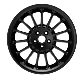
19" Multispoke Alloy Wheels - Black