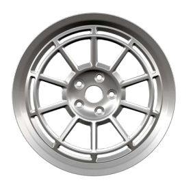
18" Superlite Alloy Wheels - Silver