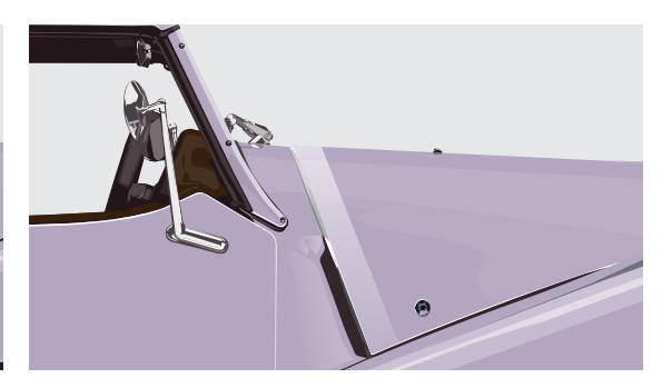
Door Roundels - Matte Clear