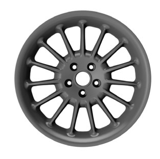
19" Multispoke Alloy Wheels - Frozen Grey