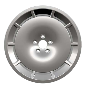
19" Forged Aerolite Alloy Wheels - Silver