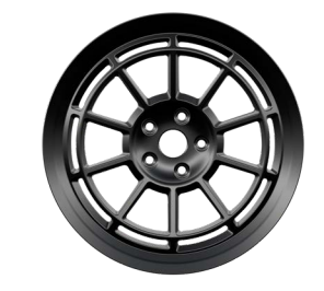
18" Superlite Alloy Wheels - Black