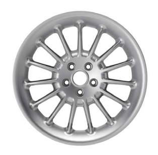
19" Multispoke Alloy Wheels - Silver