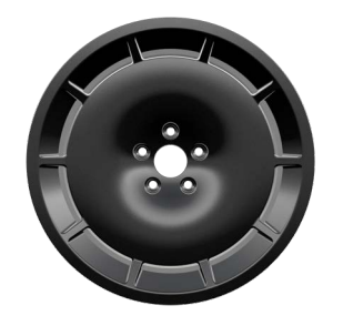
19" Forged Aerolite Alloy Wheels - Anthracite