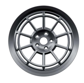
18" Superlite Alloy Wheels - Frozen Grey